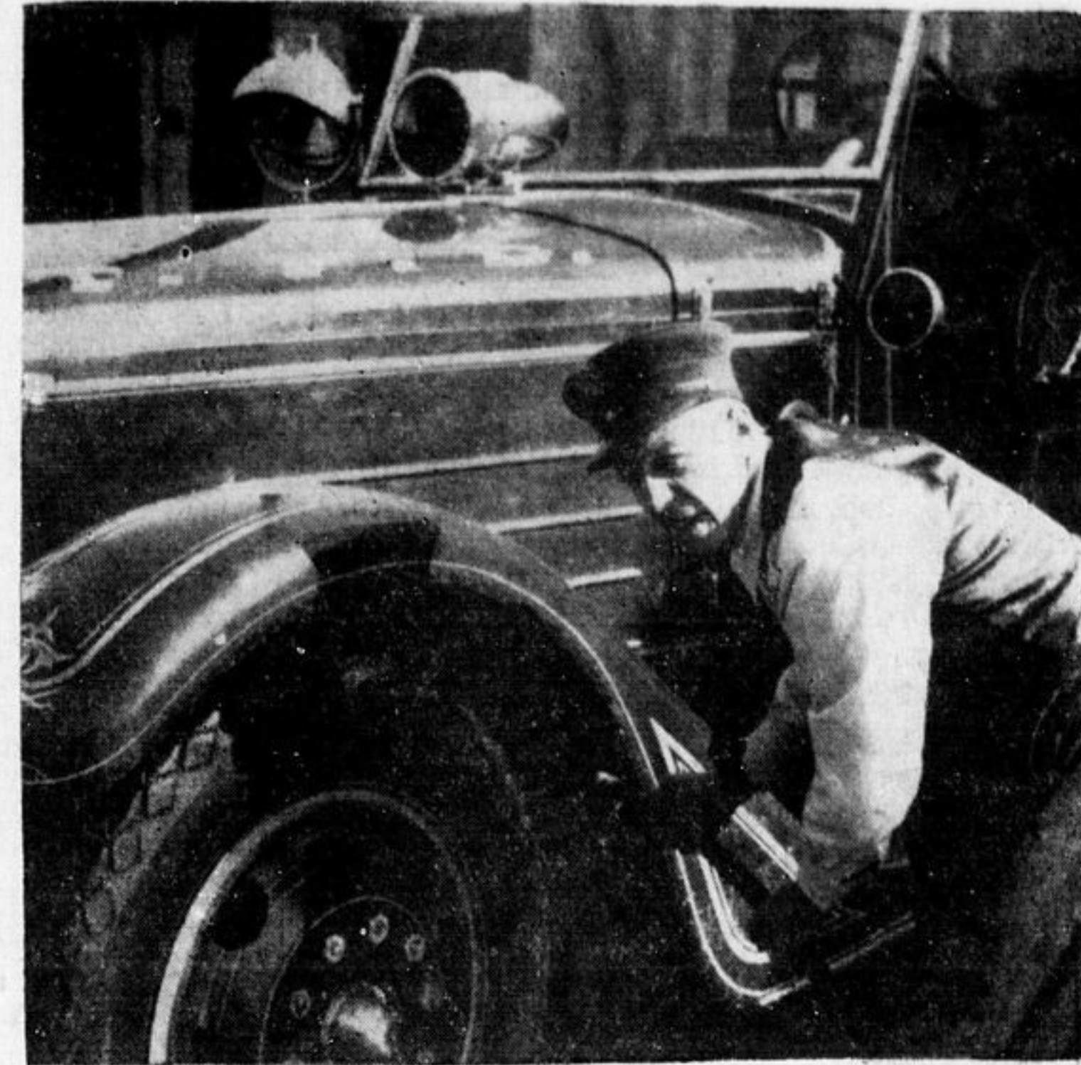
After every fire the firemen must wash down and polish all equipment for the next run. Every bit of equipment has its place on the trucks. Timmins is one of the best fire protected towns of its size in Canada. Firemen hate to ruin your buildings and homes with water and chemicals so obey the fire prevention rules.